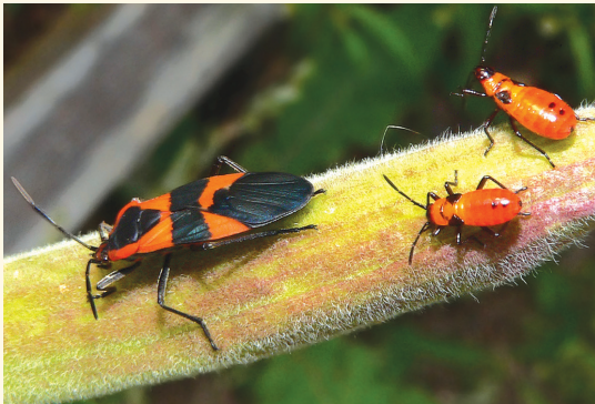
Milkweed Bug ( Berberis nevinii )

Common milkweed pests include aphids, white flies, milkweed bugs, scale insects, spider mites, thrips, and leaf miners.