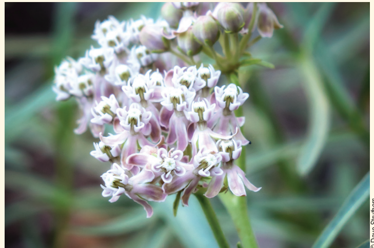
Native Milkweed will go dormant during fall and return around Valentine's day. Don't weed me out!