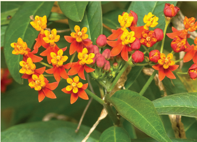
Tropical Milkweed Keep it cut back from November 1 through February.

Yellow or red, disease is spread – pink or white, Monarchs are all right.